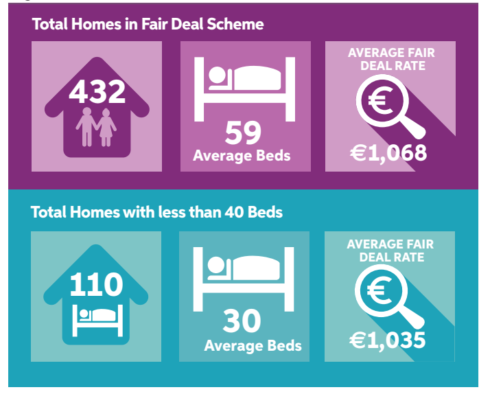
Fig.3: HOMES IN FAIR DEAL SCHEME - SEPTEMBER 2022

"This current crisis with nursing home closures must provide impetus to bring into effect a coherent policy on care for older persons and a fit for purpose, person-centred funding scheme that recognises the reality of nursing home care costs. The last thing we need is to be looking back in five or ten-years' time and wonder why we didn't do anything about it sooner," concludes Tadhg.